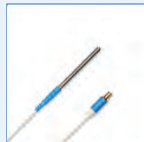
Accepts all LogTag ST100 Probes